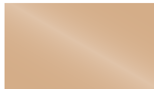
Light Bronze (LTBRZ/691)