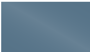
Serenity Blue (BLU)